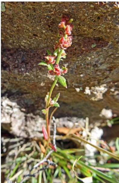
Haloragis heterophylla (Rough Raspweed)