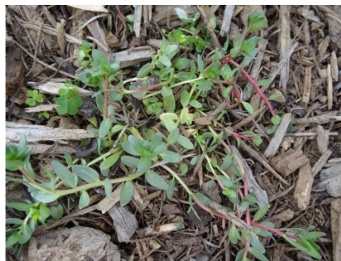
Lythrum hyssopifolium (Hyssop Loosestrife)