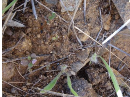
Examples of dacite weathering in the soil at STEP