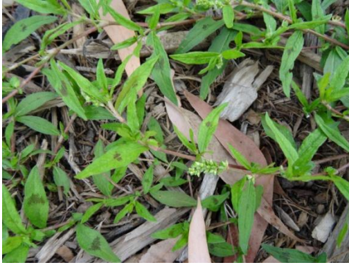
Persicaria prostrata (Slender Knotweed)