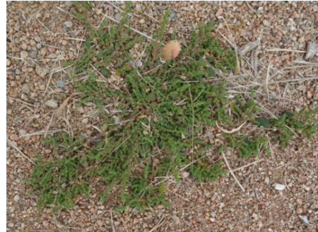
Dysphania pumilio – (Small Crumbweed)