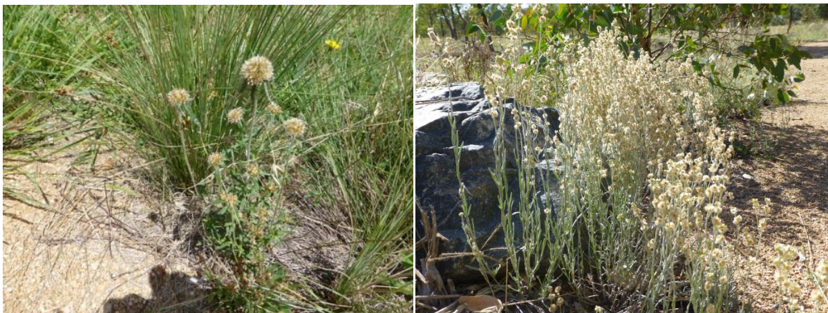
Above the two Cudweed species, left Euchiton sphaericus right Helichrysum luteoalbum .

There are at least three volunteer members of the Asteraceae family growing at Forest 20. The best known of these Helichrysum luteoalbum , Jersey Cudweed is an erect herb with pale yellow flowers often found on the edge of our paths. Another is Senecio quadridentatus , Cotton Fireweed found near the ephemeral pond. The third is another Cudweed Euchiton sphaericus . A number of the weeds that we have to deal with are also of the daisy family. These include Hypochaeris radicata Flat Weed, Conyza bonariensis Fleabane, and Cirsium vulgare Spear Thistle.