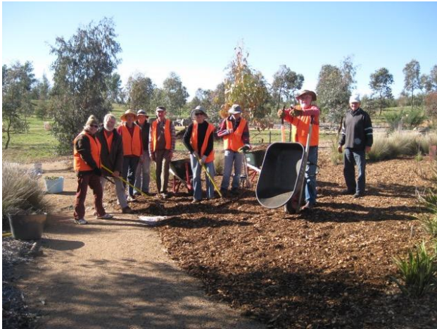
STEPpers celebrating the completion of mulching the central garden

In mid- May the Thursday STEPpers achieved a major goal for 2015 – completing mulching the central garden. Gravel paths now edge three sides of the area that is being planted with the understorey plants. Finishing the gravel path edge will be a key part of our work over the next few months.