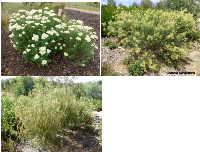
Three Cassinia species, left is longifolia , centre quinquefaria and right arcuata .

end of section C adjacent to the cross path. It is a low herb that flowered in December-January.