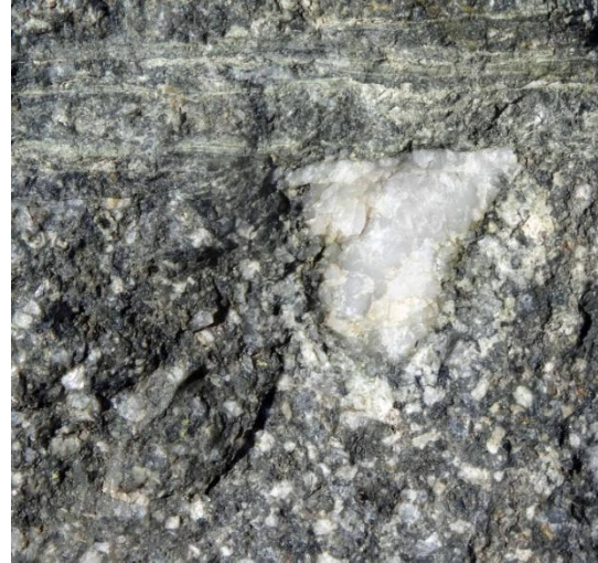
Examples of dacitic ignimbrite from STEP ( lithic xenocrysts in the left hand picture and quartz phenocrysts in the right hand picture)