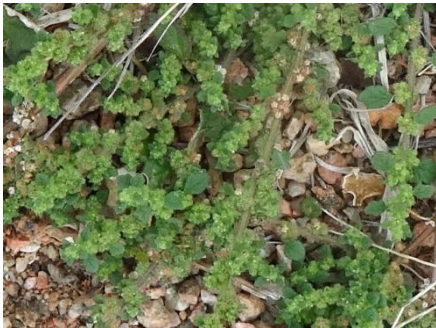
Dysphania pumilio (Small Crumbweed – close up)